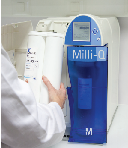
Q-Gard® Pretreatment Pack

Maintaining the Milli-Q® Reference system won't take time away from your research. Maintenance frequency is minimal, and the procedures are simplified to the utmost.