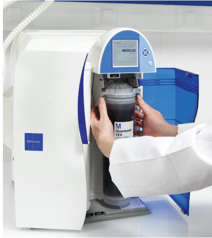
Quantum® Polishing Cartridge